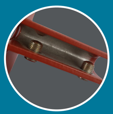
Does Not Penetrate Metal