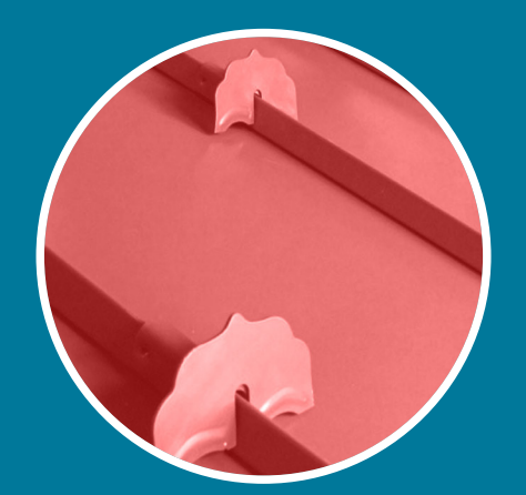
Use For Standing Seam Panels

For standing seam roofing: fits standing seams up to 3/8" wide, and most 1" through 1-3/4" seam heights.